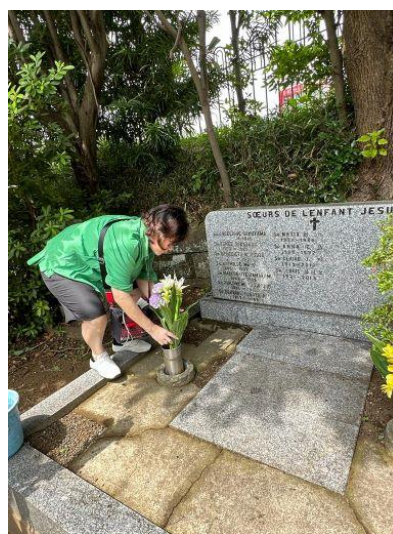
At the grave of deceased Foreign IJ Sisters in Yokohama

(Her grave and those of the early Sisters are cleaned every month by the staff and students of the IJ School in Yokohama.)