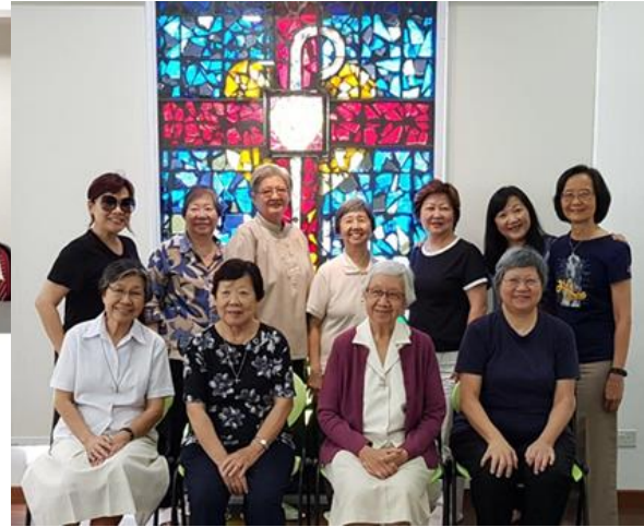
Our IJ Sisters with the Associates