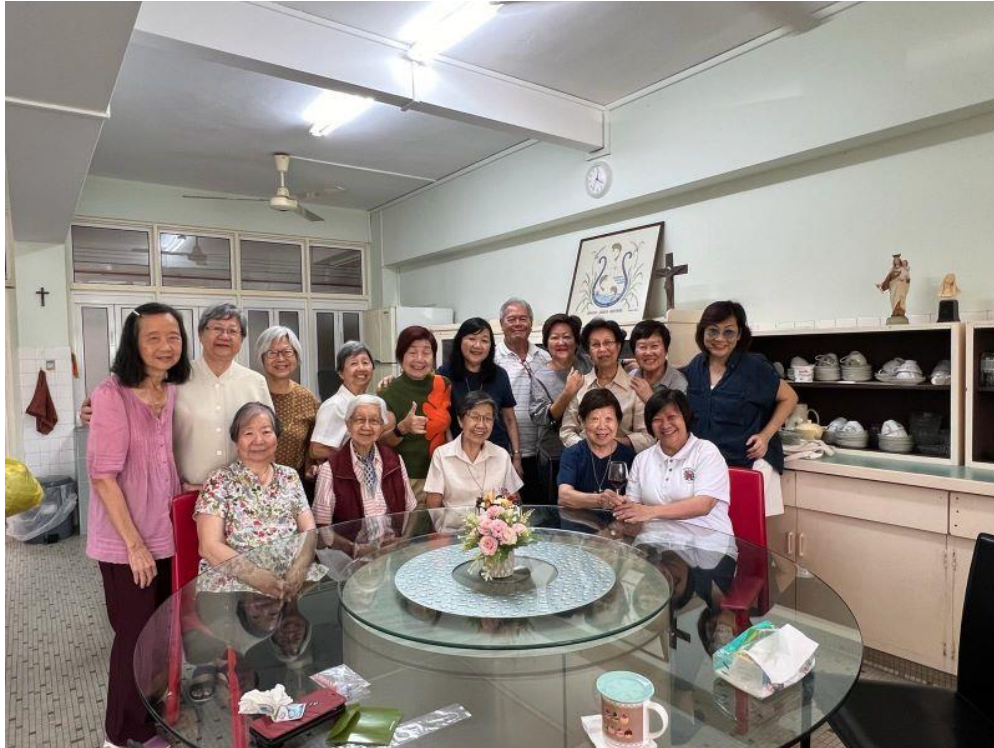
Our IJ Collaborators

IJ Collaborators advance to be IJ Associates when they decide to make a lifelong commitment.