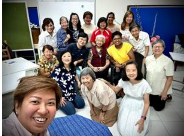
Some of our Aspiring IJ Collaborators with Associates and IJ Sisters

In our journey with lay people, we discover together how God continues to draw us to live the charism.