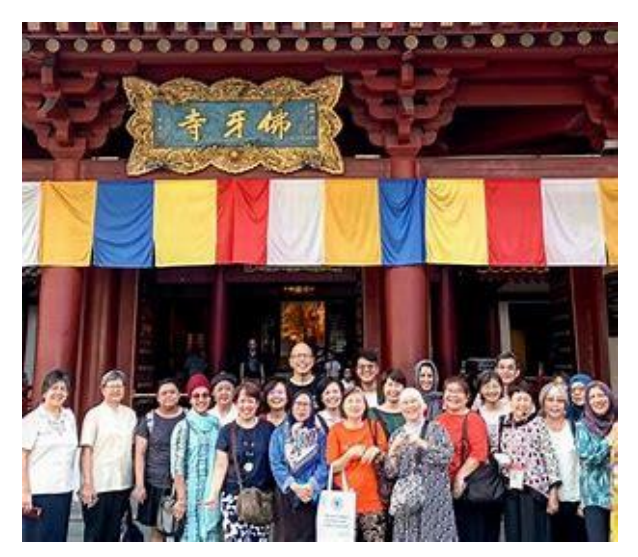
Women of faith group at the Buddhist Temple