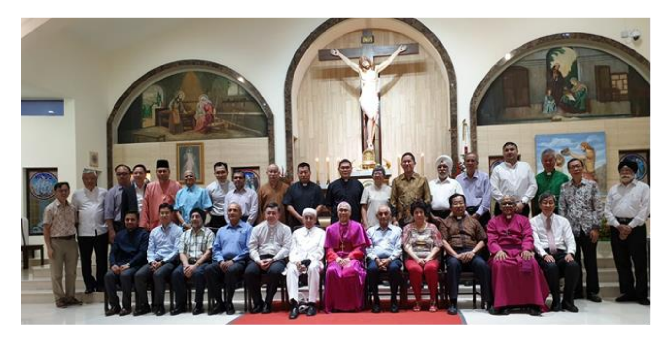
IROACCIRD members at the Christmas celebration at St Joseph's Church (BT) in 2019