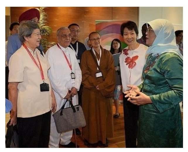
At an IRO function