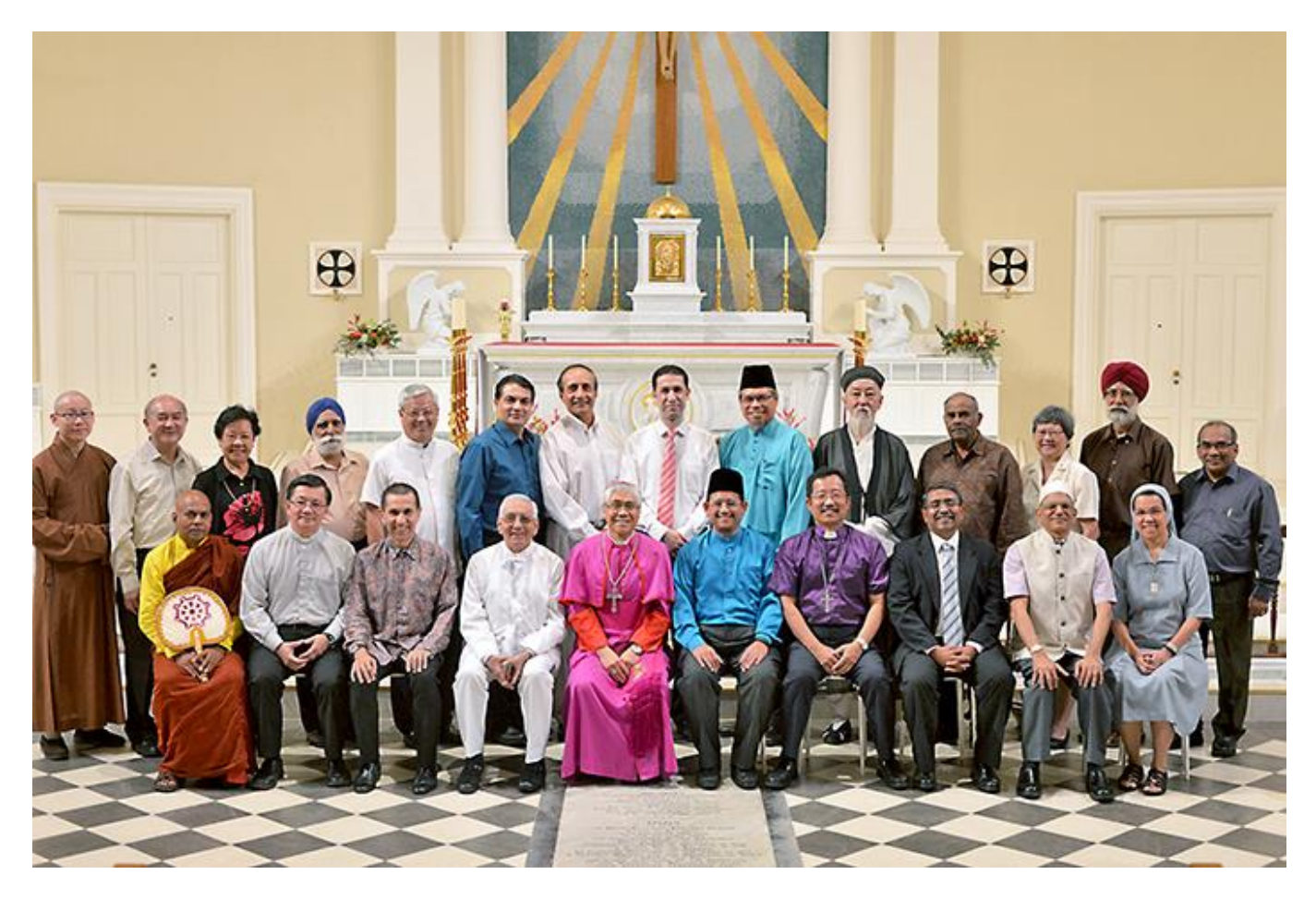
ACCIRD hosted the Christmas party in Dec 2016 at the Cathedral of the Good Shepherd

The ACCIRD arm of the Catholic Church organises the Christmas party for members of the IRO every year.