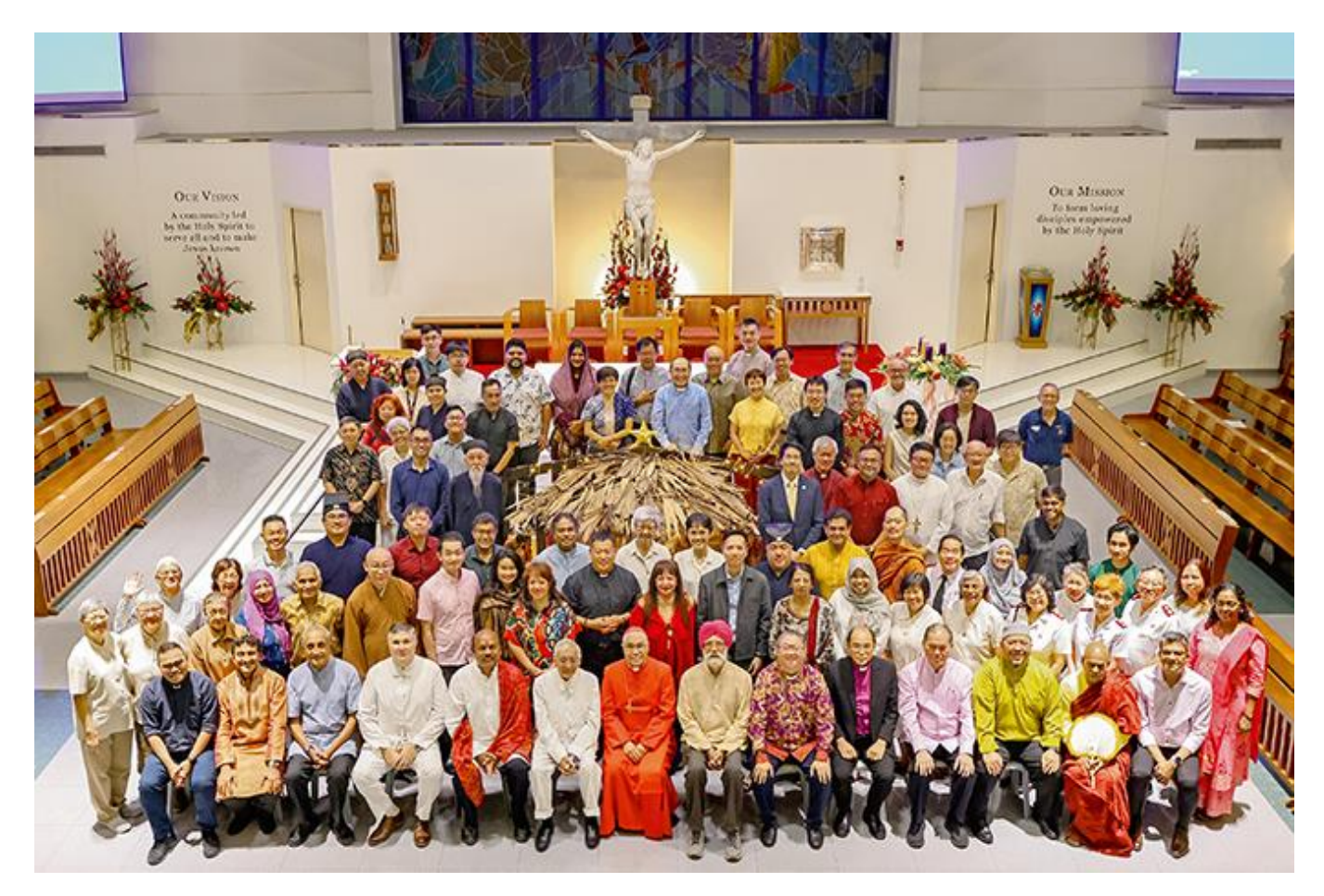
Members of IRO/ACCIRD at the Christmas celebration at Holy Spirit Church in 2024