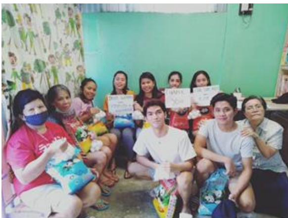
Sr with the adults receiving their parcels of food