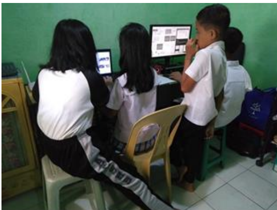
Children using the computers

"Whatever happens remain always at peace and trust the Lord." – Blessed Nicolas Barre