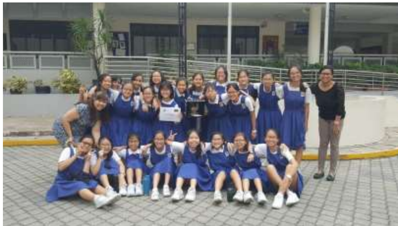
Our members with their teacher advisors

For 2016, SNGS continued working with SASCO to reach out to the elderly through their various centres and homes and forge a new partnership with APSN. With more teachers, various outreach activities can run concurrently, once or twice a month. SNGS continued their long-term mission outreach in Siem Reap @ Kbon Primary School. They raised funds to build their water tank. Girls are involved in the planning of outreach programmes. Continued self-initiated projects by the pupils are on-going.