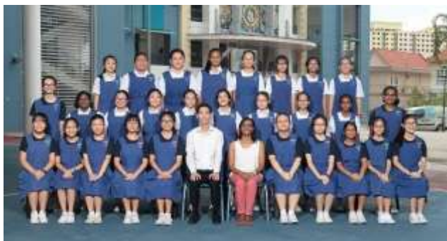
Our members with their teacher-Advisors

CHIJ St Joseph's Convent IJYM did successful outreach at the All Saints Home and also HOME. They had organized successfully an outing for HOME residents to SJC. The Shoebox project was also a great success. For 2016, SJC continued local mission outreach with All Saints Home and HOME.