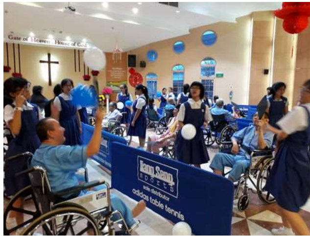
Interaction with the Elderly