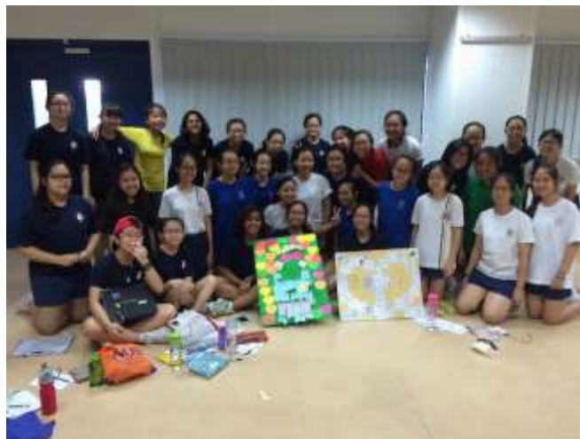
CHIJ TP students with their art and craft skills

All members participate in the annual IJ Youth Mission Inter-school Competition to showcase their community service and programme for the year. The IJ Youth Mission (CHIJ Secondary) has attained the Certificate of Distinction from 2014 to 2019.