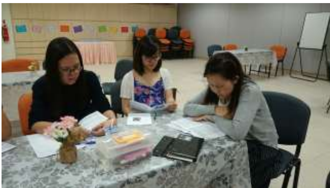
(Above) Participants in prayer reflecting on the theme: "Educating hearts and minds"

Teachers and past pupils who believe in the IJ education, mission and ideals and have a strong conviction of the need to keep the IJ identity, heritage and legacy alive in the CHIJ school, have asked for a 2 day session on understanding the "IJ Spirituality" and the IJ vision of education as envisioned by the founder.