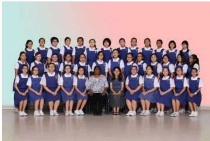
The members with their teacher-advisors

CHIJ St Theresa's Convent IJYM had worked well with their new mission partner, Beyond Social Services, to serve the community, especially the young. Local outreach last year was with Willing Hearts. For 2016, STC worked with another outreach centre. Teachers left the initiative to the IJYM girls to plan and organize the outreach.