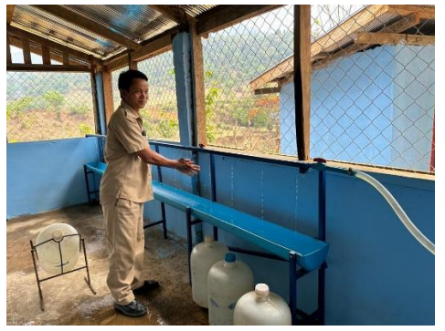
New water trough at Pana