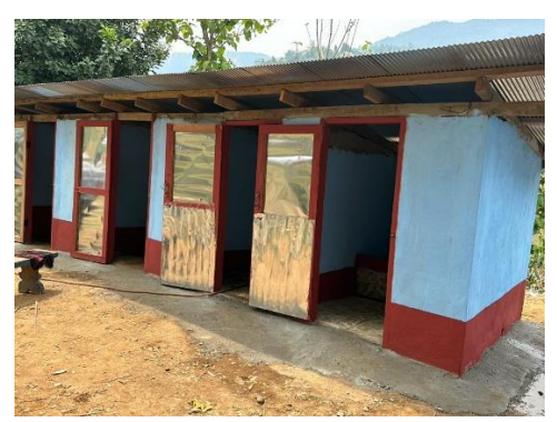
New toilets at Pana