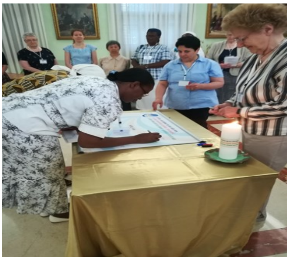
Each delegate signed her commitment to the work of the Chapter on the Logo poster