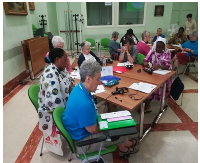
Chapter delegates taking part in the Discernment Workshop.