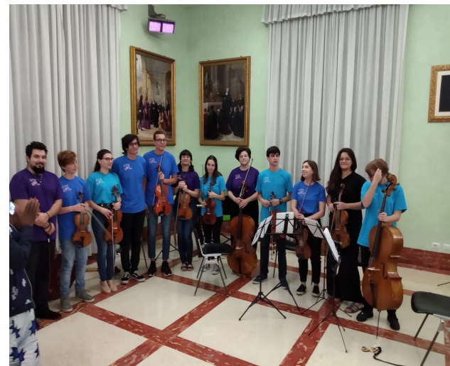
Young musicians who performed for the delegates