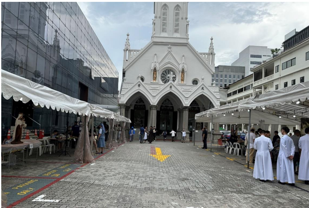
The Vocation Fair was held on 30 April 2023 at Sts Peter and Paul Church

This is our promotion poster for CHIJ Sisters for Vocation Sunday 2023.