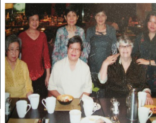
Photo 1 At CJC Carnival, Photo 2 with students and staff, Photo 3 with some staff