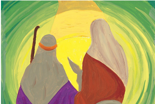
Journey to Bethlehem

The Christmas season is with us once again and I wish you an abundance of joy as we celebrate this special feast. Christmas is one of the times when we are especially united throughout the Institute as we pray for and send greetings to one another. May your celebration of Emmanuel, God-with-us, bring you great joy – “a joy to be shared by the whole people” (Lk 2:10), including each one of you and your loved ones.